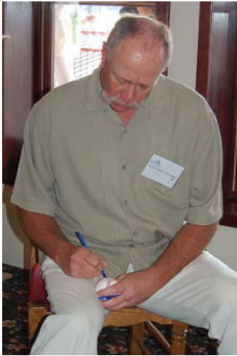
"Goose" signs some baseballs for fans.